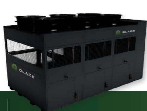
Rowan and Maple

Clade publish a wide range of COPs at different operating conditions. See website and product data sheets for details.