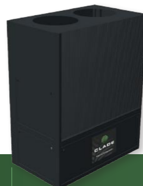
Acer and Birch